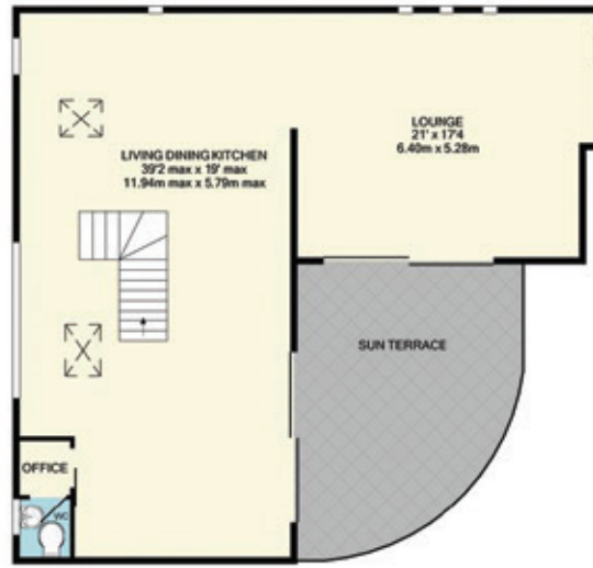
FIRST FLOOR APPROX. FLOOR AREA 1013 SQ.FT. (93.7 SQ.M.)